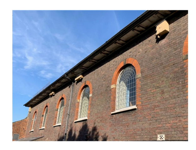
All Saints Centre nest boxes

We are very pleased to have received lots of requests from Lewes Residents asking for advice about installing Swift boxes on their home or workplace! As you know, the lack of suitable nest spaces is one of the factors that has contributed to the decline in the Swift population: as many old buildings have been renovated or demolished and modern building methods do not allow for the nooks and crannies where Swifts choose to nest.